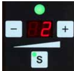
Strap tension easily adjustable with press button