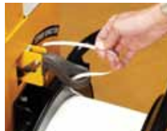
Simple coil change