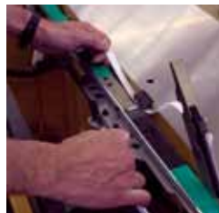
Maintenance without tools