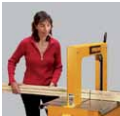
For use as a stand alone machine or integrated into conveyor systems