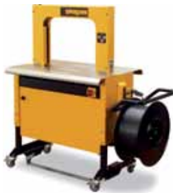
Robust, compact design